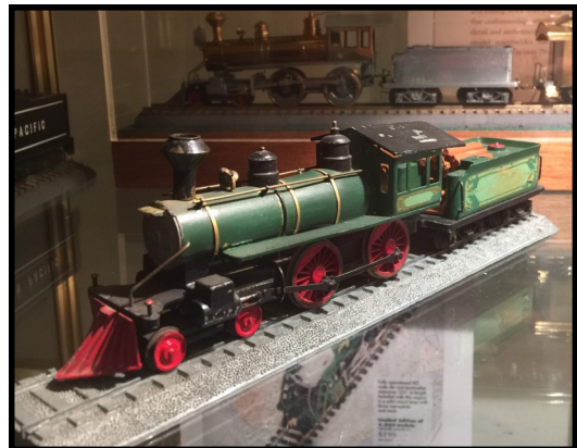
Exhibit open until March 30, 2018. Museum hours are Monday, Wednesday and Friday 1-4pm. Also open Sundays, February 25 and March 25, 2-5pm. The Museum is located at 58 N. Broad St., Woodbury. For group tours, call (856) 848-8531.