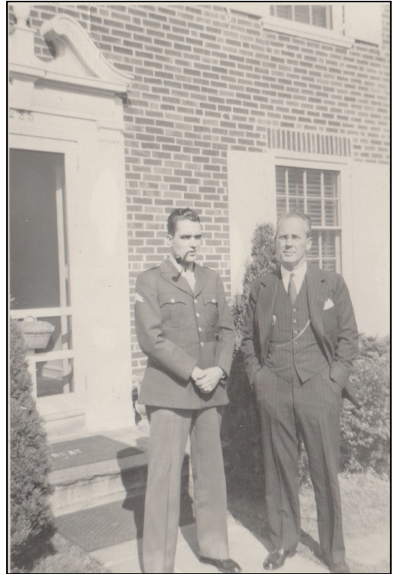
House number is 285. Last two letters on welcome mat are "AY."