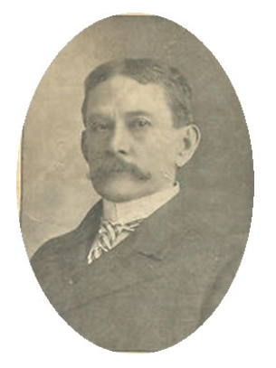
May 20, 2021 @ 7:00 pm

Join the Gloucester County Historical Society for a Zoom Presentation